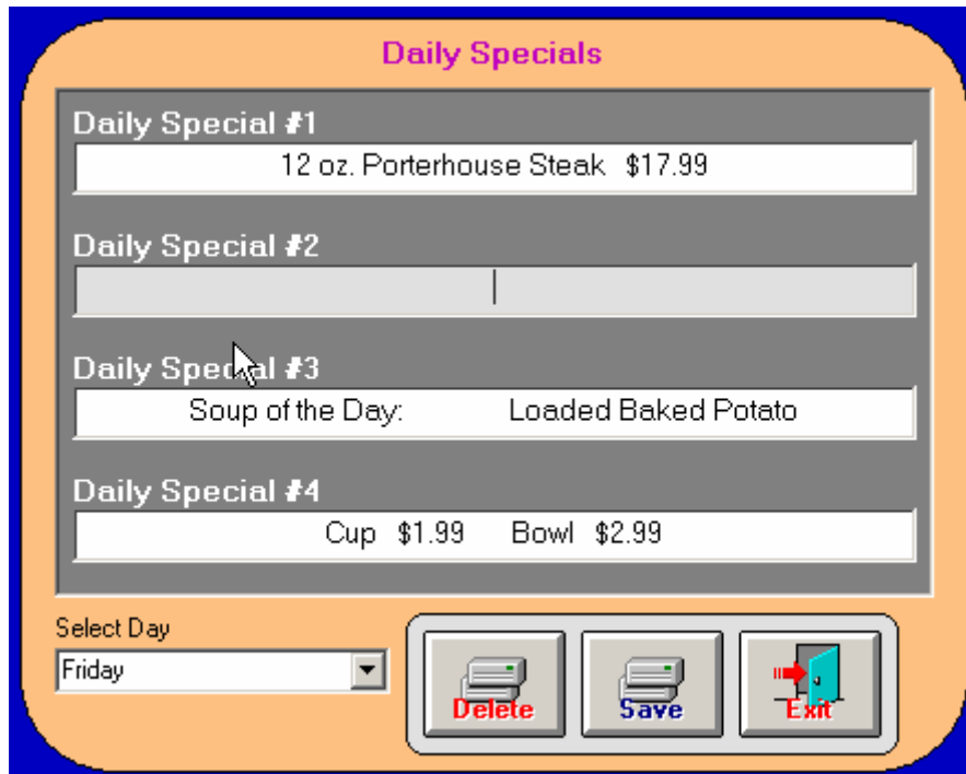
Manager Menu – Messages Menu – Daily Special

Daily Specials or other messages for employees can be set to appear on the ID Screen.